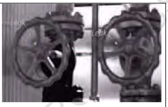
Figure 3.40: Typical visualisation of gas leak