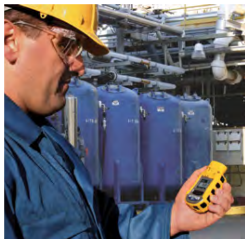
Worker exposure monitoring with ToxiRAE Pro PID at a PVC plant