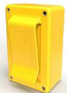
Back of the P2P VibraTag has a clip to attach it to clothing.