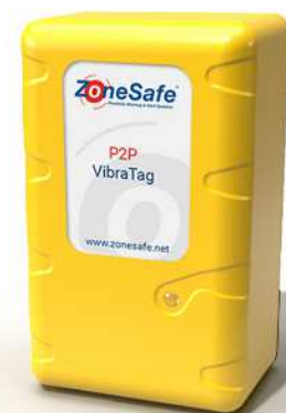
Front of the P2P VibraTag.